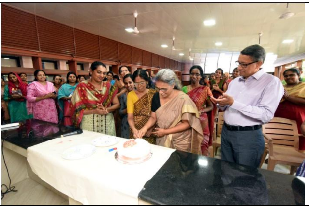
Cake cutting ceremony with the Director

A special photo shoot of ICAR-CIFT, Cochin staff was arranged on 3 March, 2020 to uphold the IWD's theme on 'Gender Equality'.