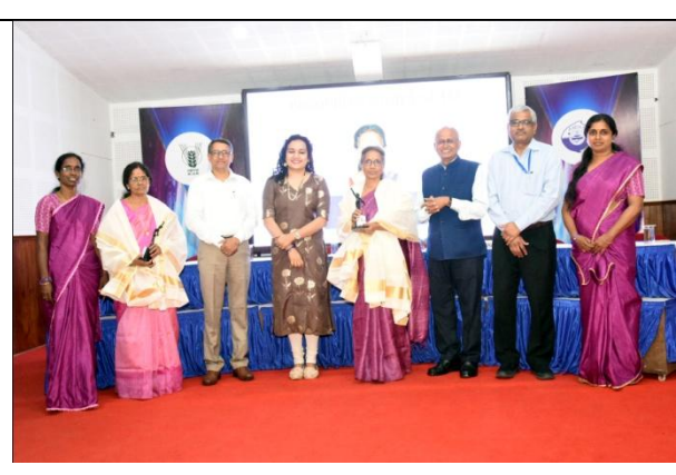
Honoring women staff of ICAR-CIFT