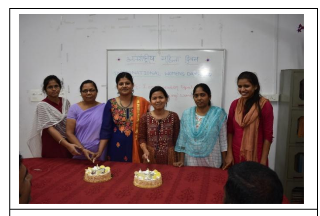
IWD celebration at Visakhapatnam RC of ICAR-CIFT